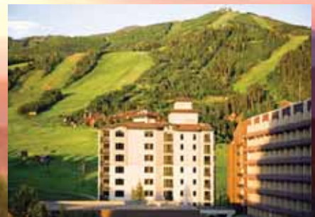
At the Sheraton Steamboat Resort, Steamboat Springs, CO