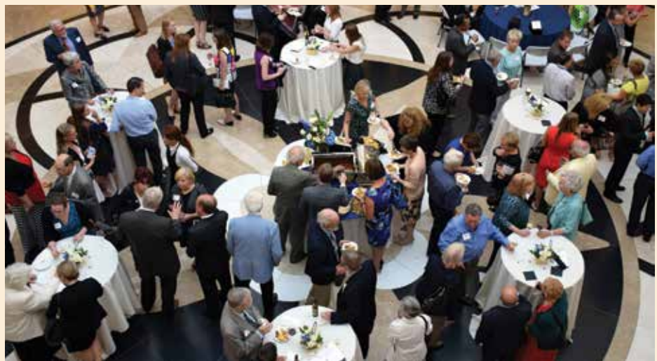
Standing room only at the DBA Annual Awards Party and 125th Anniversary Celebration.

The DBA Mentoring Program , which is run in association with the Colorado Attorney Mentoring Program (CAMP) , achieved