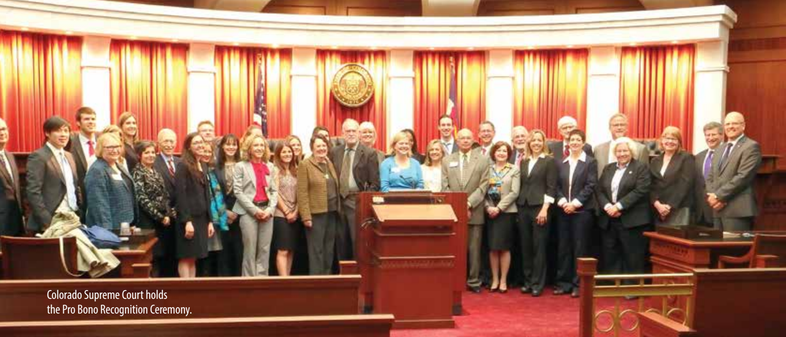
Colorado Supreme Court holds the Pro Bono Recognition Ceremony.

total of $47,750 in food and funds during the Roll Out the Barrels Food Drive in April. Approximately 300 Denver Public Schools students received backpacks brimming with supplies needed for the 2015 school year. Another popular CAN event, Strikes for Tykes , raised $3,565.41 for the Children's Outreach Project in October. In March, the legal community also donated several boxes of dental items during the Toothbrushes for Tots drive.