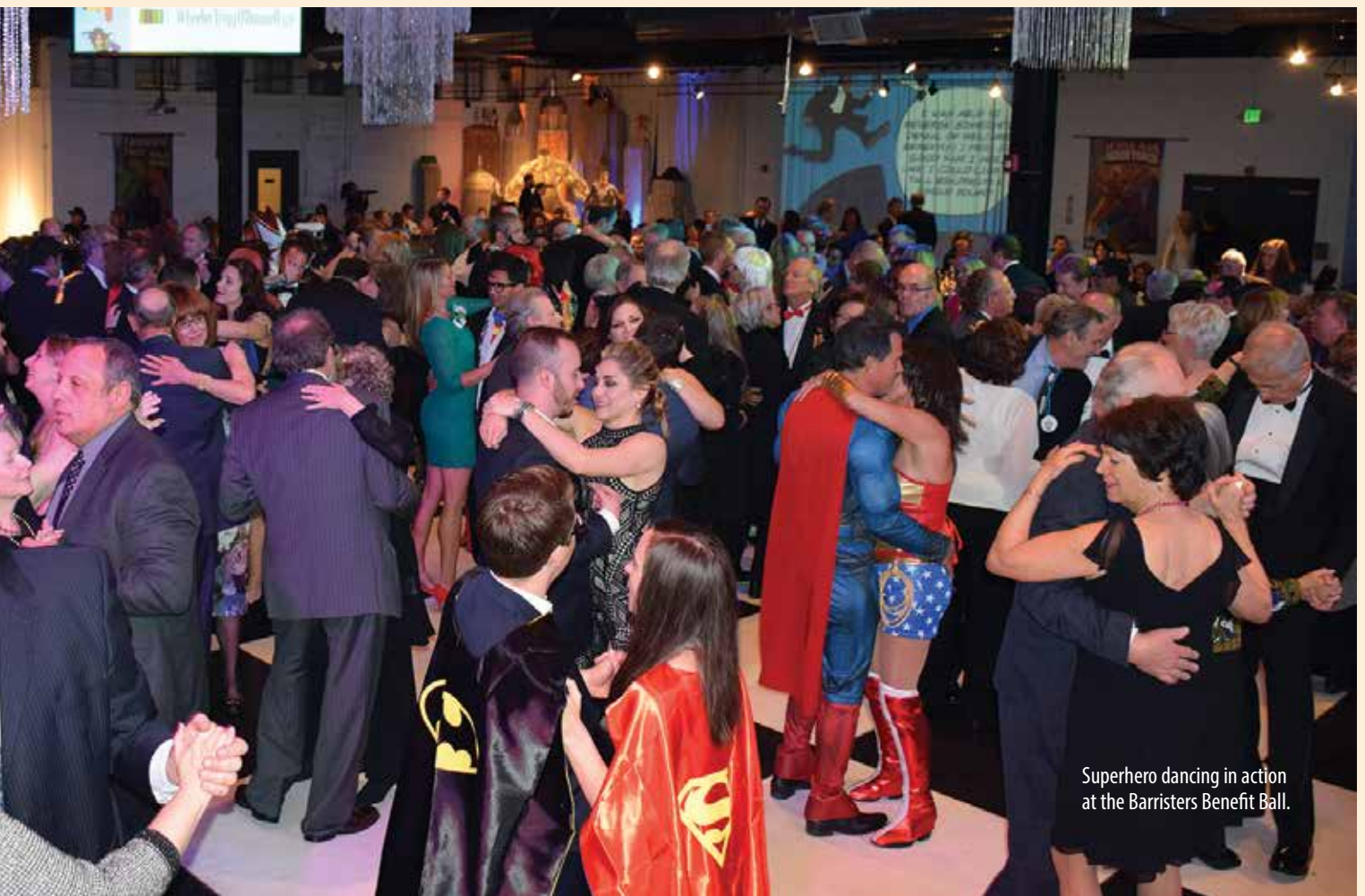
Superhero dancing in action at the Barristers Benefit Ball.