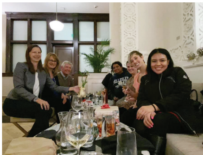
The Docketeers discuss news, new articles, and bar updates as they share hors d'oeuvres.

On December 3, members of the DBA's Docket Committee and staff met at Cooper's Lounge for the annual Docket holiday party and bar review. This year included a white elephant gift exchange. Partygoers enjoyed a festive evening with cocktails, snacks, and holiday cheer, and rumor has it the bamboo pig caused quite an uproar.