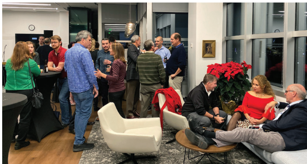
Members celebrate the holidays with hors d'oeuvres and cocktails.

On December 12, the CBA Workers' Compensation Law Section celebrated the holidays with live entertainment and good company. The section thanks all of its members for a wonderful year!